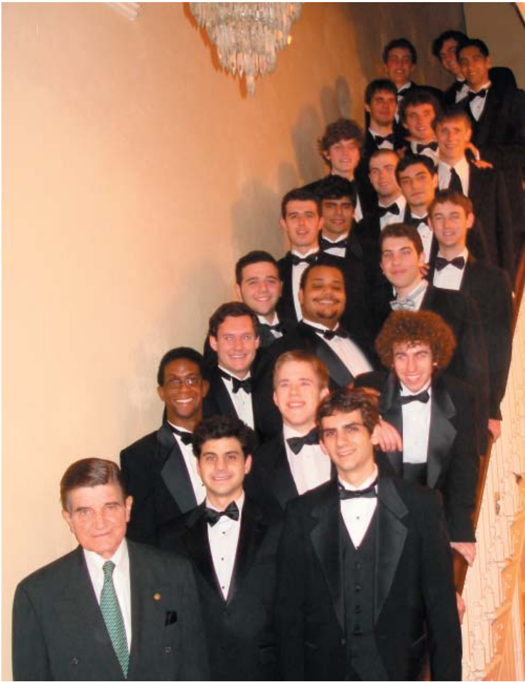
(Left) Initiates of the 175th line gather on the stairs at the House following their Initiation Weekend on March 15th, 2007.