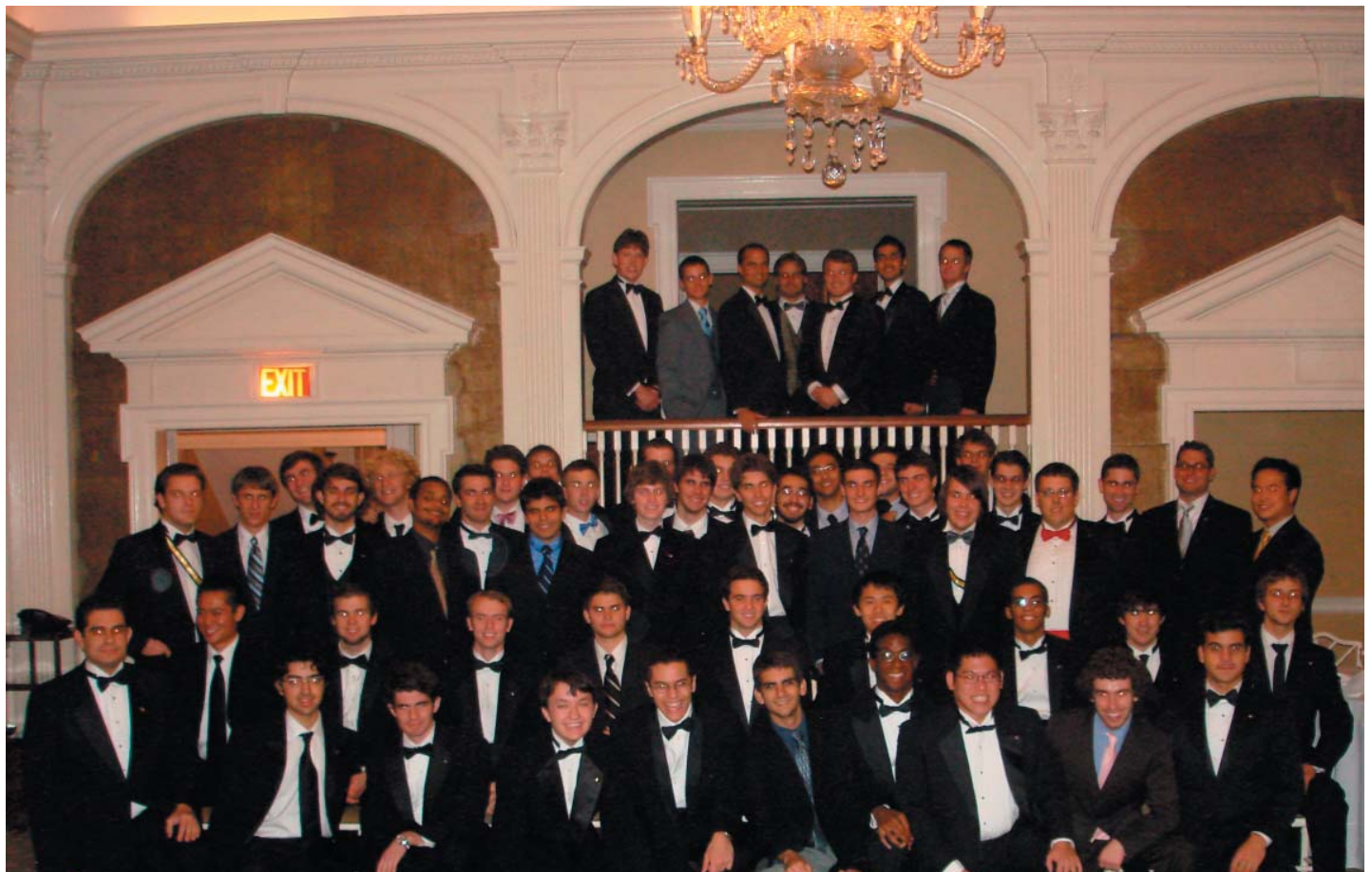
(Below) Undergraduates and alumni met at the City Tavern Club on M St. for the 176th Initiatory Banquet on Sunday, November 11, 2007.