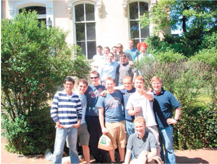
Seniors from the Class of 2007 gathered at the House for one last barbecue in May. The Class of 2007 established a DPE Senior Class Gift fund prior to graduation, and used funds raised to donate a new barbecue grill to the undergraduate brothers of Alpha Chapter